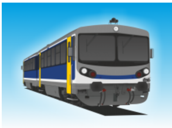
[10]Diesel multiple unit V.

2 bicycles can be carried in the train section marked with the bicycle pictogram.