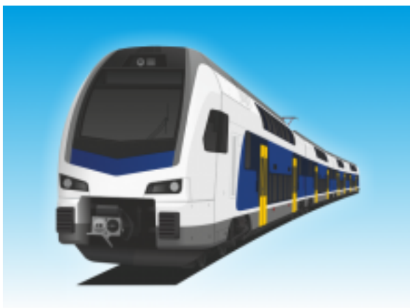
[2]Electric multiple unit II.

12 bicycles can be carried in a designated area of the passenger compartment (in the middle of the train), secured by safety belt.