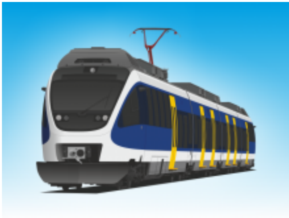
[3]Electric multiple unit III.

6 bicycles can be transported in the designated part of the passenger compartment (folding seats), secured by plastic straps.