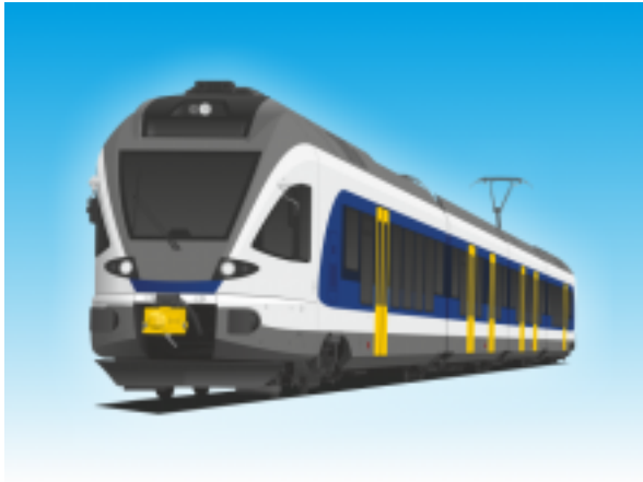
[1]Electric multiple unit I.

6 bicycles can be transported in the designated part of the passenger compartment (folding seats), secured by safety belt.