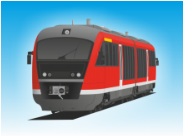
[6] Diesel multiple unit I.

4 bicycles can be transported in the multi-purpose space with fold-down seats.