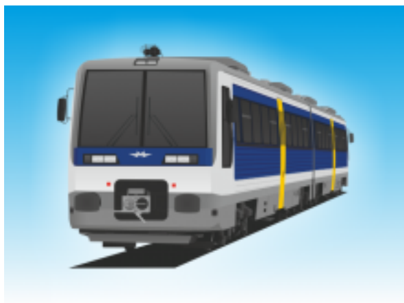
[7]Diesel multiple unit II.

2 bicycles can be transported in the multipurpose space on hooks.