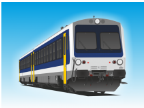
[8]Diesel multiple unit III.

5 bicycles can be transported on hooks in the bicycle transport section.