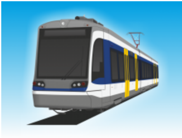
[5] Diesel-electric multiple unit (TramTrain)

4 bicycles can be transported in the multi-purpose space, secured by safety belt ( depending on the current congestion ).